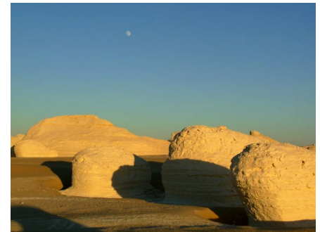
Black and White Desert

Courses approved for Cultures Credit: Arab Society (ANSO), Peoples and Culture of the Middle East and North Africa (ANSO), Art and Architecture of the City of Cairo (ARTX), Muslim Political Thought (POLS), and Selected Themes and Topics in Arabic Literature in Translation (LIT).